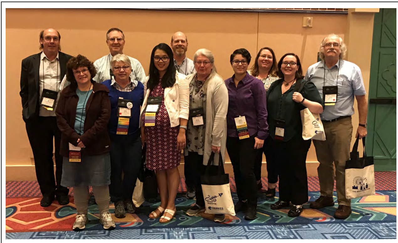
Some of the NEMATYC members who attended AMATYC 2018