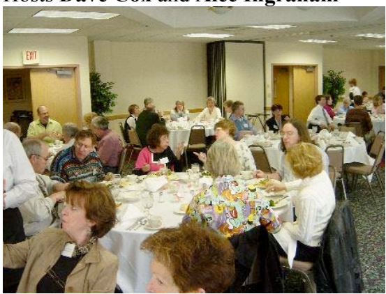
The food and facilities were great!